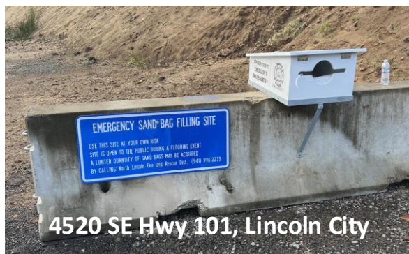
4520 SE Hwy 101, Lincoln City