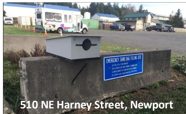
510 NE Harney Street, Newport