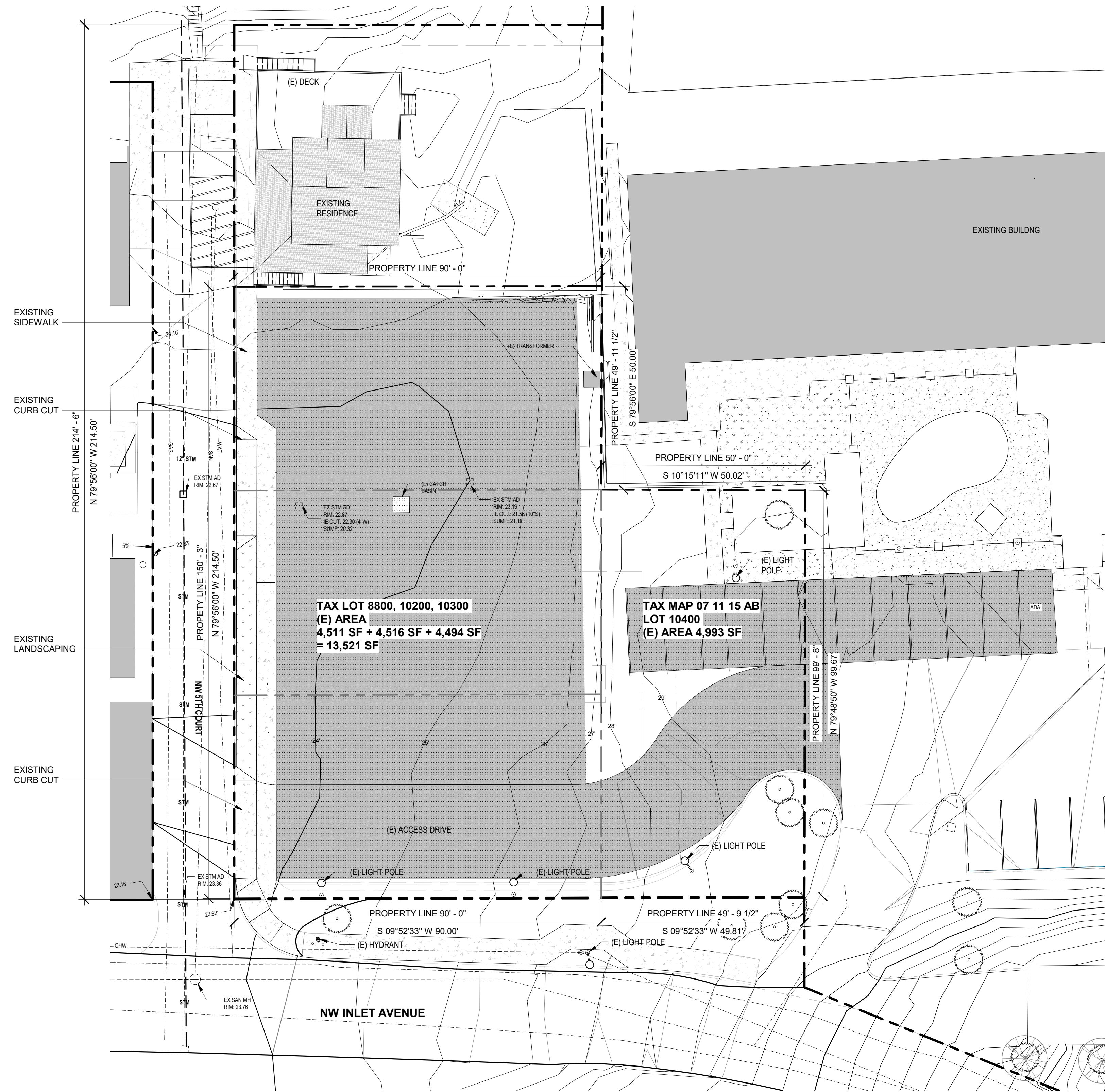
1 EXISTING PLAN 1/16" = 1'-0"