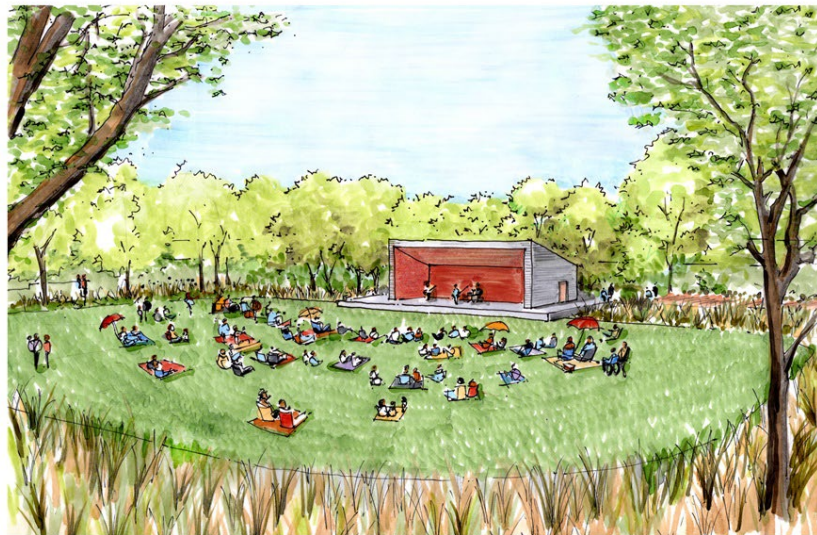
Illustration by Nicolai Kruger Studio