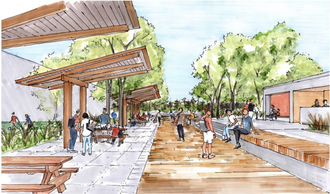
Illustration by Nicolai Kruger Studio